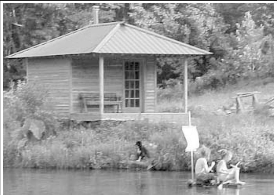
"The Skinner Box," Twin Oaks' recently completed sauna, sits proudly on the shore of our pond as a couple of scurvy pirates sail by

Well, it's been quite some time since the News has been written (nearly a year), and what a year it's been! Last fall, we were at the tail end of a three-year drought; we had drilled a new agricultural well because the old one had gone dry, and the city of Charlottesville was posting dire warnings that they would completely run out of water by Christmas. All of that changed last November; and since then hardly a week has gone by without lots of water (snow, rain, or both) falling from the sky. The South Anna river, which had been reduced to no more than a long, skinny puddle, has returned to life—several times this year, melting snow and heavy rain pushed the river out of its banks. Our riverside fields—and Yanceyville Road—have been hidden under four feet of water! To cap off a whole year of stormy weather, the fall hurricane season blew in with a fury and brought us Hurricane Isabel (see accompanying article) and eight days without power, a record for Twin Oaks.