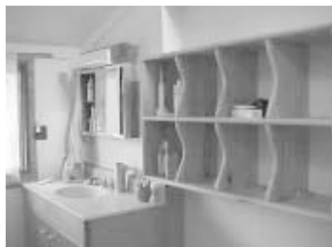
Homemade cubbies adorn the new Ta Chai bathroom.

During the winter, members were encouraged to find work outside of the hammock shop, which freed up hundreds of hours of labor. The community dealt with this situation by freeing up domestic labor areas that are normally budgeted. One result of this decision was a flurry of activity in domains like commie clothes, archives, and building renovation and upgrade. The Ta Chai bathroom has been beautifully remodeled, with a new shower and lots of new woodwork. In Tupelo, rooms that had been