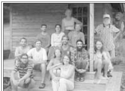
With the Sauna finally complete, the intrepid crew gathers for a group photo