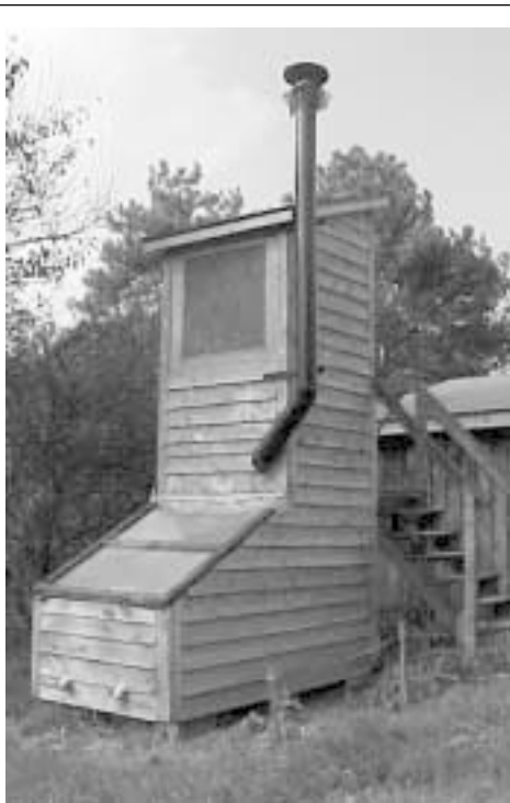
"Fecotopia," the courtyard's new composting toilet, is rumored to have the best view around.