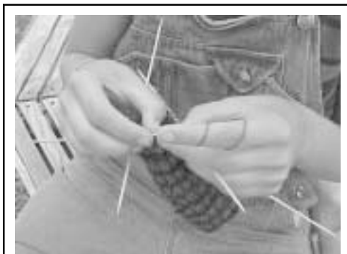
Anja, one of our most talented knitters, works on her very first sock.

Meanwhile, business was modestly booming for Twin Oaks Tofu—until the great blackout of '03 — with a growing team of foolhardy tofu workers, new distribution, and new production techniques (designed by River and ex-member Alexis) that allow us to make significantly more tofu each day than we had previously been producing. Several single-day production records were broken in September, the most recent being over 1800 pounds! As always, we are continually searching for new and creative income areas. One such project, organized by Phoenix and others, has been to give presentations and lectures at college campuses—already Oakers have visited campuses in Ohio, North Carolina, and Pennsylvania, and may soon be at a college campus near you! Woody, having