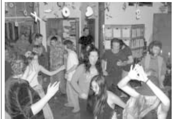
Dancers on Validation Day were inspired by the music of our very own blues band, Blues Explosion.

In March, several Oakers took part in a performance of "Lysistrata" in Charlottesville, as part of an international anti-war protest. This winter and spring, many Oakers traveled to nearby cities to take part in anti-war demonstrations in nearby cities, despite the all-too-frequent occasions when heavy snowfall prevented us from leaving the property. And every Sunday, a load of Oakers continues to travel to Richmond, bearing pounds of homemade tofu, to join Food Not Bombs in distributing free vegan meals to the city's homeless.